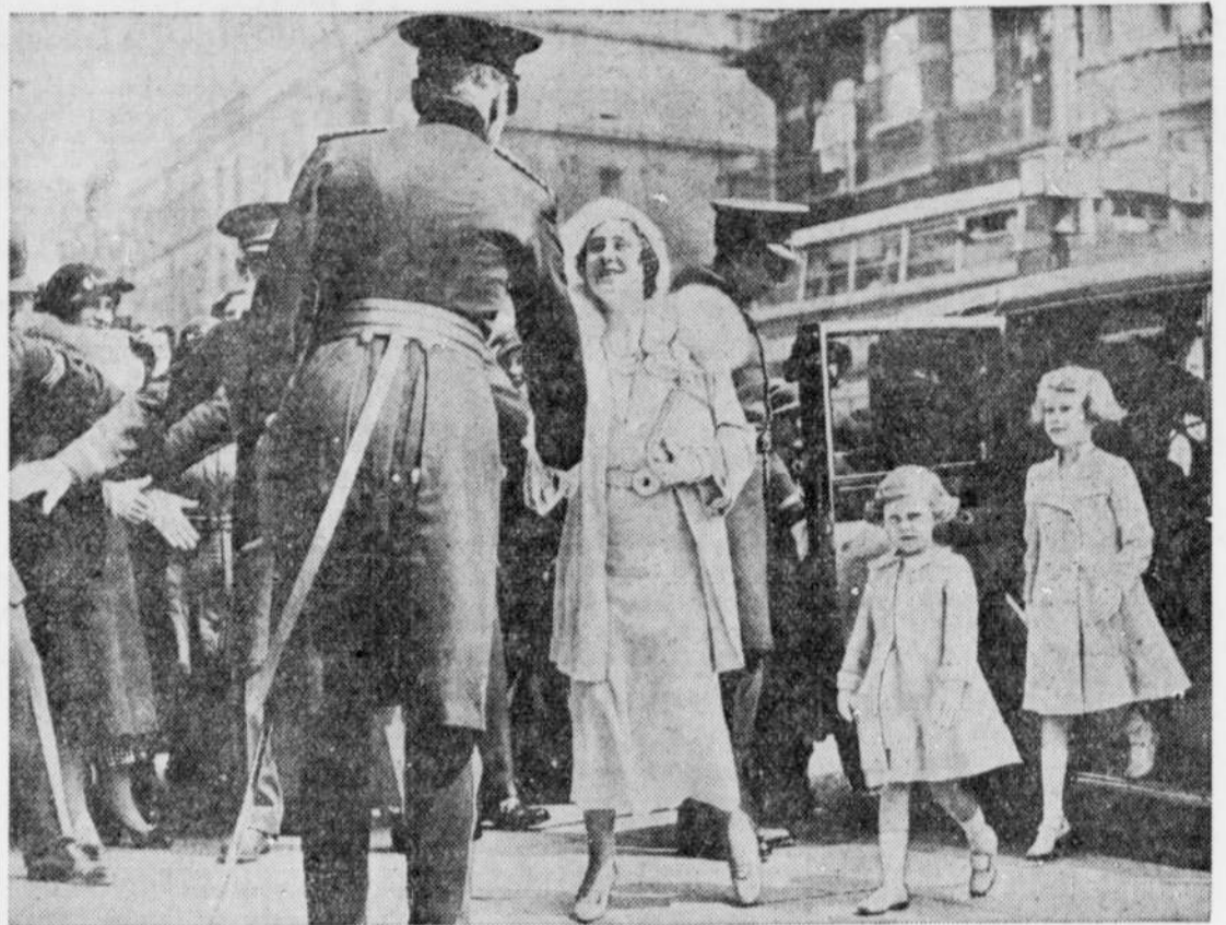
Illustrating the democratic qualities that made her popular as the Duchess of York is the above photograph of Queen Elizabeth of England. Instead of the formal bow, she rushed forward to give an impulsive handshake to the official who greeted her at a London function. Behind her are her children.