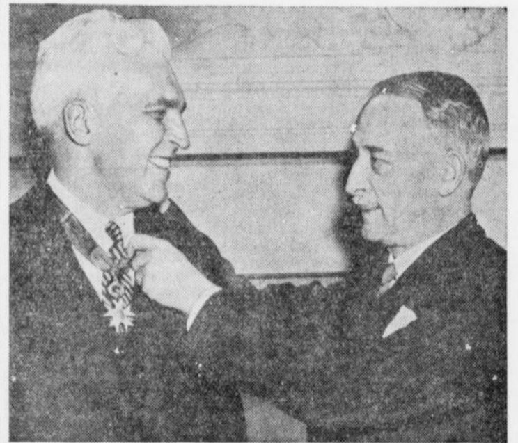
Paul V. McNutt (left), retiring as governor of Indiana, is pictured receiving the decoration of a commander of the Legion of Honor from M. Andre de Laboulaye, French ambassador of the United States in Washington recently. Mr. McNutt is a former national commander of the American Legion.