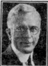
W. C. COLEMAN

Readers of this paper can get full details of this remarkable lamp, including illustrations of the many beautiful models, by simply sending a postcard to W. C. Coleman, Dept. WU-171, Wichita, Kansas.