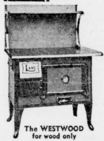
The WESTWOOD for wood only ● Good dealers recommend the LANG range to you because of its high quality, long life, appearance, practical service, and economy of operation. Satisfied LANG users, including the housewife, the chef, and the logging camp cook, are enthusiastic boosters for these Western-built ranges. We are pleased to present these high-grade Northwest-made ranges at prices within reach of all. For cooking... kitchen warmth... water heating... all in one, buy the LANG Range.

The manufacturer guarantees this pattern for twenty years.