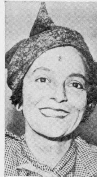
In a momentous decision based on "divine inspiration," Elsie Janis, one-time popular stage star and "sweetheart of the A. E. F." during the World war, has disclosed plans to dispose of her worldly possessions and to devote the proceeds and her life to local charities.