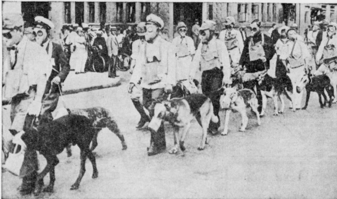
Tokyo.—Civilians and their dogs parade through the streets of the Japanese capital wearing gas masks in a demonstration of the preparedness of the civilian population for a gas attack when and if the next war comes.