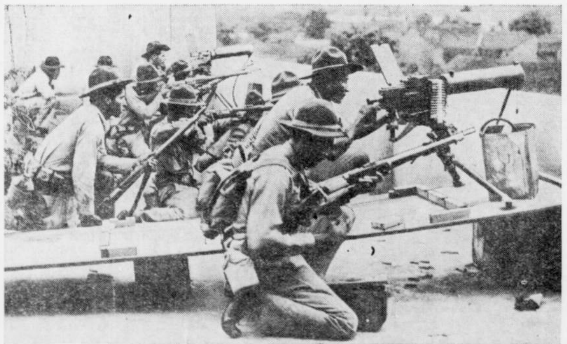
National Guardsmen, American-trained, who led the revolt that forced resignation of President Juan B. Sacasa, are shown on top of the national bank building during fighting in the capital. The machine gun units shown here did considerable damage to federal forces.