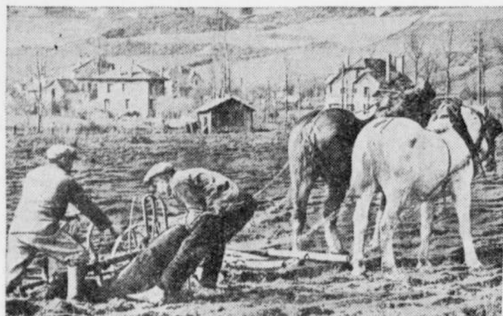
These French farmers working below the walls of Coucy-le-Chateau near the Alsne are unearthing a large unexploded shell deposited there by a German gun. Since the war many farmers have been killed or maimed by the explosion of old shells.