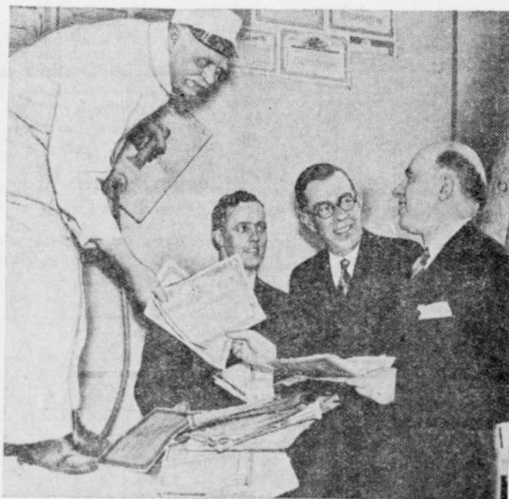
Stock certificates which had depreciated to the point where they were good only as wall paper and which were used as such in the "Million-Dollar Room" of the Union League club of Chicago, are being removed from the wall and returned to their donors, since some have "come back" in value.