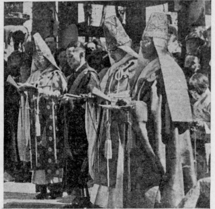
In a colorful ceremony in the beautiful Japanese Tea Gardens of Golden Gate park, San Francisco, oriental priests commemorate the twenty-five hundred and second anniversary of the birth of Siddhartha Gautama, known to the world as Buddha, founder of the great Buddhist religion. The ceremony, called "Wesak," which is the Sanskrit word for "the time in April of the full moon," included a ritual of pouring tea over a baby Buddha.