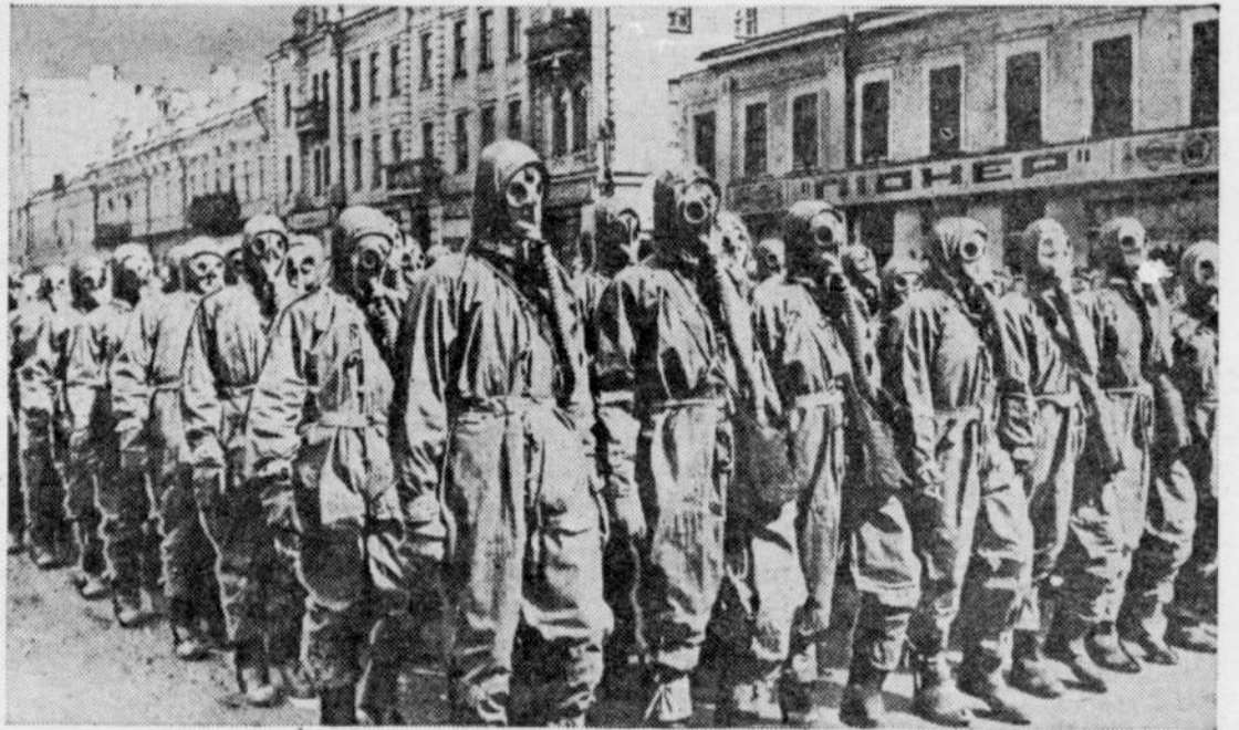
Citizens of the Soviet republic marching in Kiev in gas masks and anti-mustard gas suits in honor of the Soviet heroes at the ninth congress of the Young Communist league.