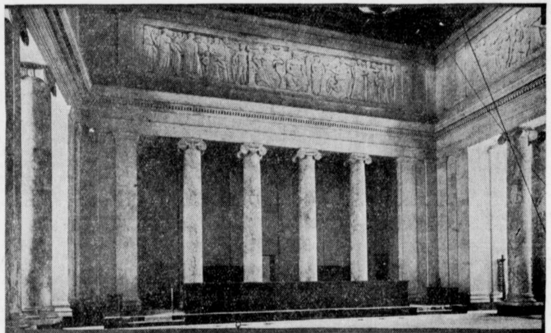
This is the almost completed chamber for the United States Supreme court in the new building which the highest judicial tribunal will occupy this fall, in the new magnificent marble structure which has been built for the court.