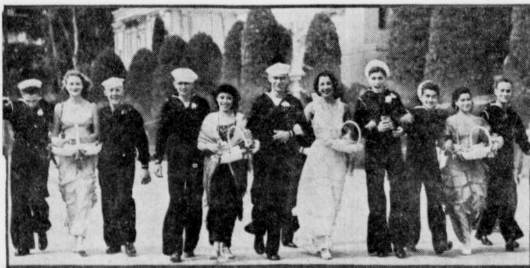
When the fleet came in at San Diego, Calif., after maneuvers, the sailors enjoyed themselves at the California Pacific International exposition, and found that the flower girls of the fair were the best of playmates. The sailors here seem to be thoroughly satisfied with the situation.