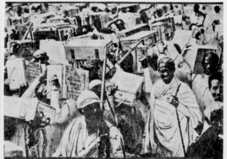
Carrying ammunition in boxes upon their shoulders, these Ethiopian soldiers are mobilizing at Addis-Ababa, the capital, in readiness for the expected attack on their country by the Italians. The troops of Emperor Haile Selassie are fierce fighters, but seem to have old-fashioned rifles and to lack military form.