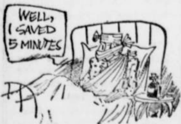
He saved five minutes and lost five weeks

A little ordinary courtesy would help, also. We are usually