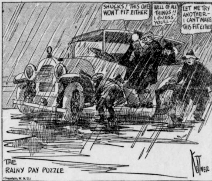
THE RAINY DAY PUZZLE