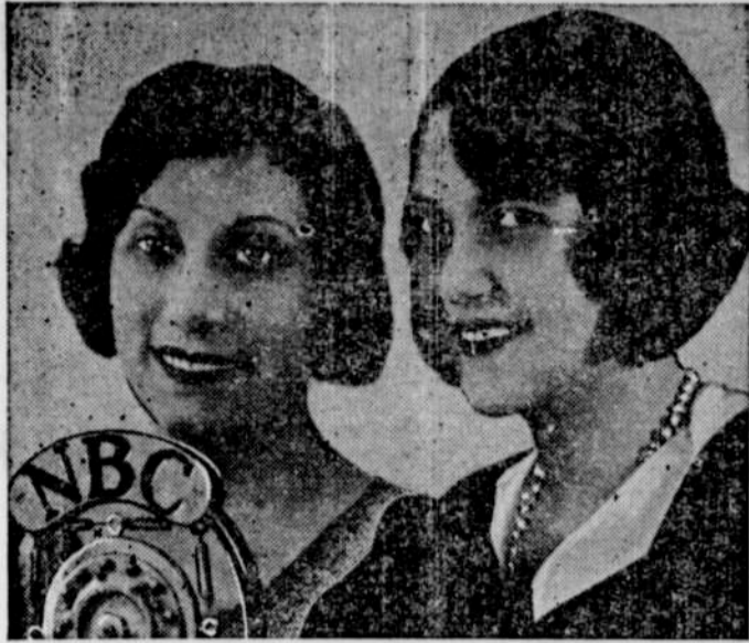
Beginning tonight at 7:45, the new Sperry Sweethearts program will be heard each week over the National Broadcasting System.