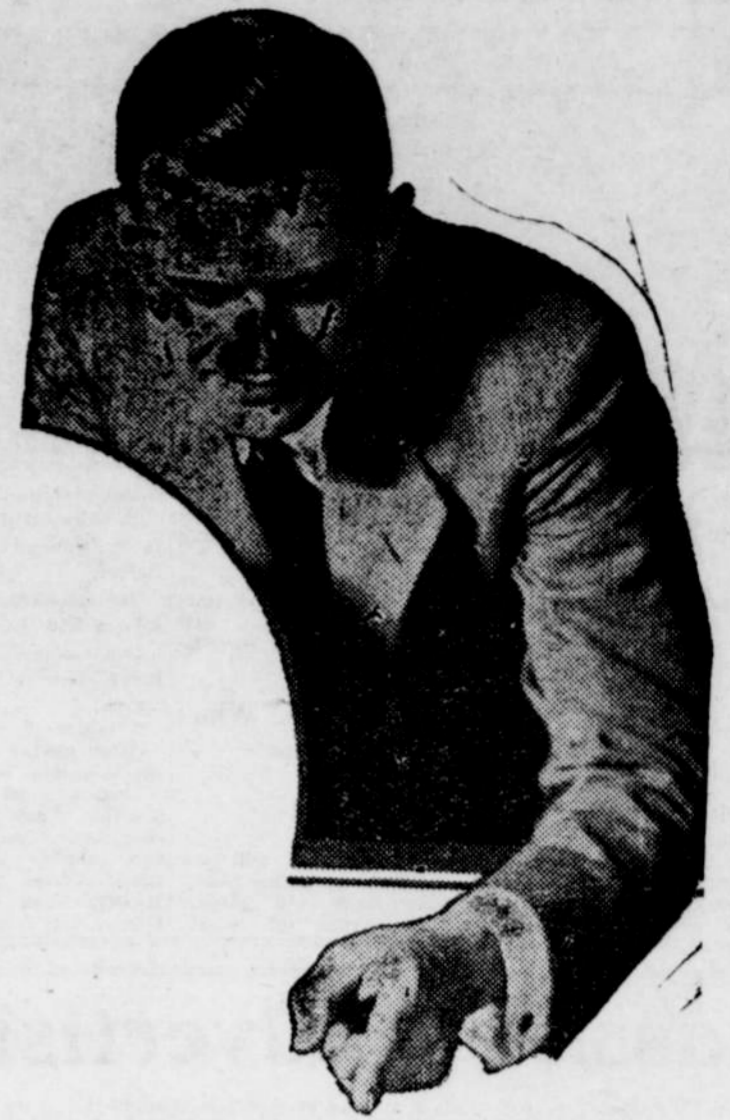
Men of This Community