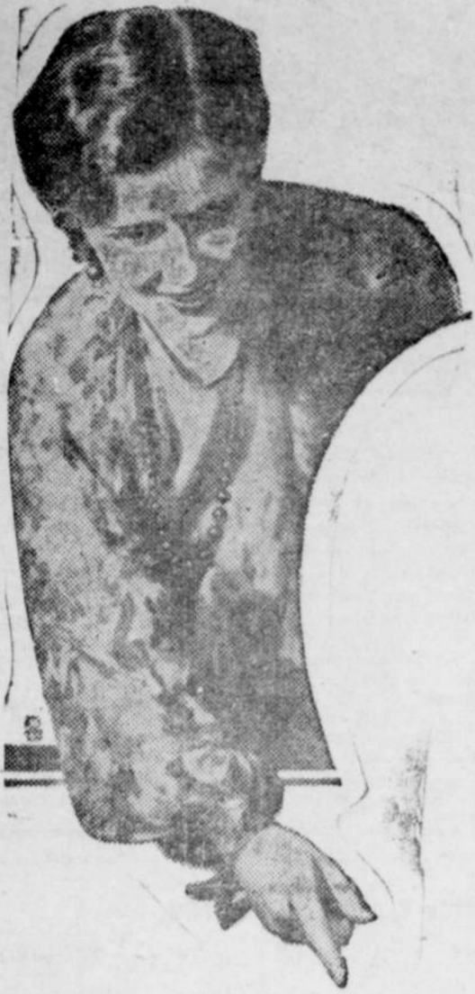
Women of This Community