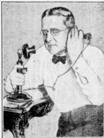
SENATOR GEORGE MOSES of New Hampshire, chief at Eastern Hoover-Curtis headquarters, takes his coat off and goes to work on campaign plans.