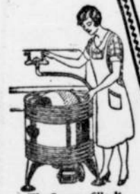
The Savage fills direct from the faucet through its own hose