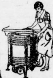
The Savage empties by means of its own ejector pump—at the touch of a toe!

Without any obligation have us give you the FREE HOME TEST of the famous "Savage" Washer innovation:—