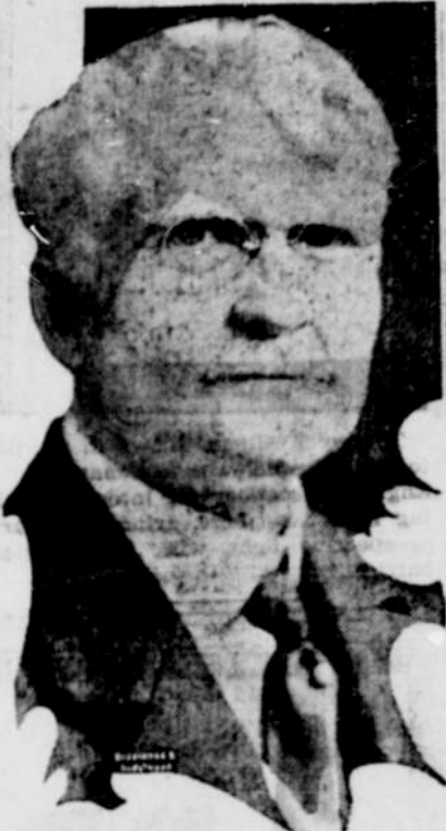
This is a new portrait of Lawrence Davis Tyson, who has succeeded John K. Shields as United States senator from Tennessee. He was on hand when the sessions of the Sixty-ninth congress opened.