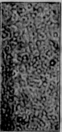
Globules After Homogenization.

Globules in relatively large globules, forms large tough curds in the stomach and is much harder to digest. In evaporated milk the fat is broken up by homogenization and the curds softened until in size and digestibility they resemble natural infant food."