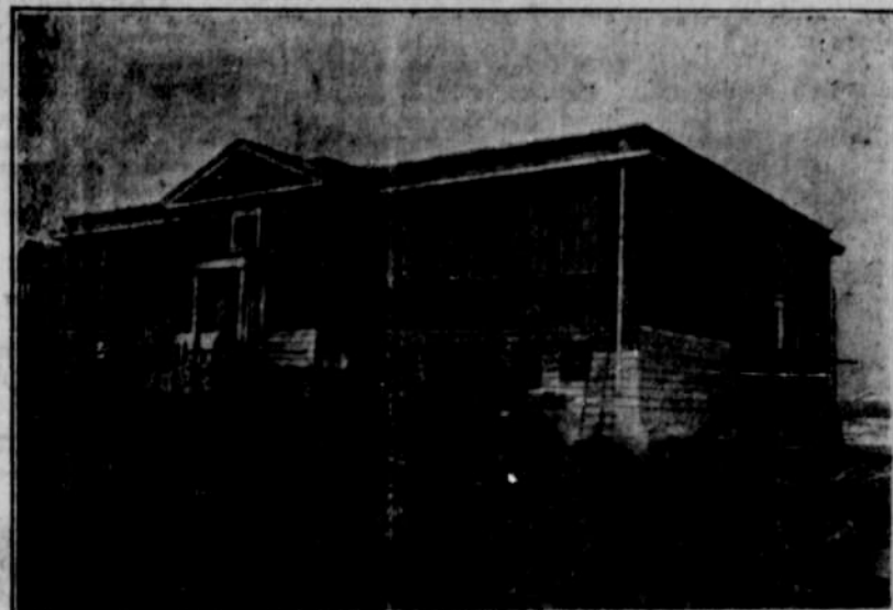
LINCOLN GRADE SCHOOL

at that time were not what they are today. The subjects then could not be delved into as they are today. The course of study was inadequate. Today in the fast growing city of Vernonia we have the Lincoln and Washington school (the Washington is not