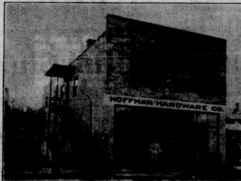
HOFFMAN HARDWARE CO.

The Hoffman Hardware company, located on Bridge street in the business part of Vernonia have a highly up-to-date brick fireproof building adding much to the appearance of the business structures found on this artery. The building has a stucco front with large show windows.