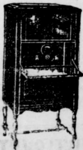
Magnavox 75 with speaker enclosed, 5 tube tuned radio frequency. Price without tubes or batteries—$200.00

The radio public knows what it wants—the New Magnavox Receiving Set