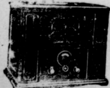
Magnavox 25 with speaker enclosed, 5 tube tuned radio frequency. Price without tubes or batteries—$145.00

Magnavox means superior quality in Radio Sets, Magnavox means Ease of Operation.