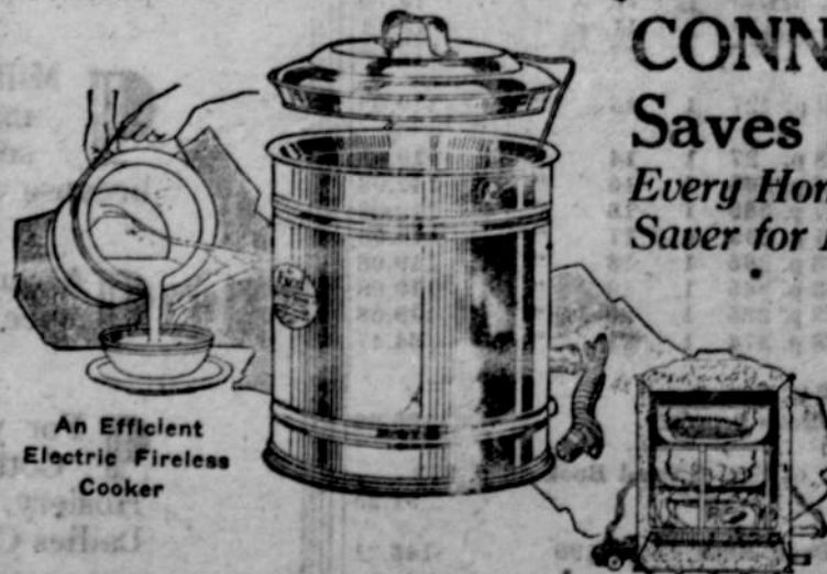
An Efficient Electric Fireless Cooker

Here is a cooker that has revolutionized cooking. It cooks anything any way you want it cooked. It is ideal for home, small apartments, summer cottage or wherever cooking is done. You simply put in the food, turn on the current until it is hot, then turn the current off and the stored heat does the cooking.