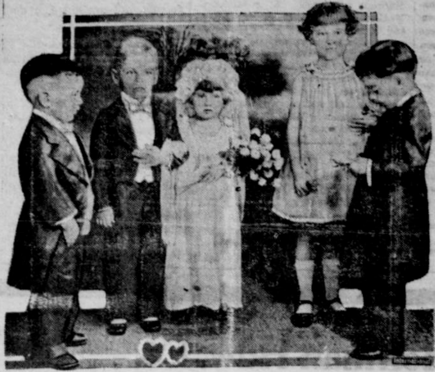
Daytona, Daytona Beach and Seabreeze, in Florida, were united recently in the new city of Daytona Beach with a population of 20,000. The feature of the celebration was the wedding pictured above, in which Mr. Daytona Beach married Miss Daytona, with Miss Seabreeze as maid of honor. Mr. Commercial Enterprise was best man and Rev. Civic Spirit performed the ceremony.