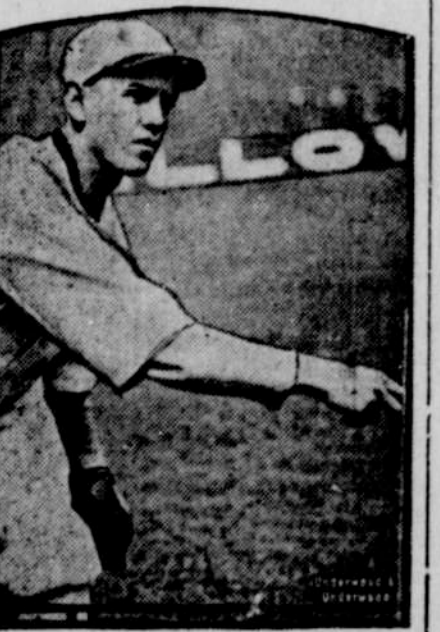
Photograph of Ted Lyons, youthful pitcher of the Chicago White Sox, who, sporting authorities declare, is to become one of the outstanding figures in the American league. He is the ideal build for a pitcher, being six feet tall and weighing 175 pounds. He is a right-hander with an easy delivery.