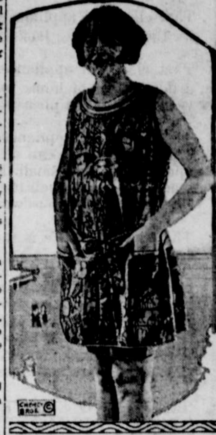
Here is pictured another of those newly arrived beach suits of printed

that go so much toward making their wearers highly decorative parts of beach scenery. These pretty suits are not so revealing as the regulation swimming suit which follows the lines of the figure--whatever it may be--with merciless fidelity. Beach suits undertake with great success, to do a little flattering.