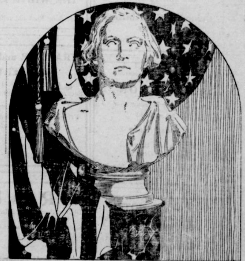
Washington's Birthday Feb. 22nd.