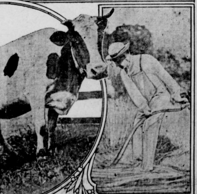
HAYING ON HIS FATHER'S FARM

Calvin Coolidge early took his place upon the farm. Born in Plymouth, Vermont, twelve miles from the nearest railroad depot, he is the son of a dirt farmer and has experienced all the hardships, reverses and arduous labors that fall to the lot of the farmer boy.