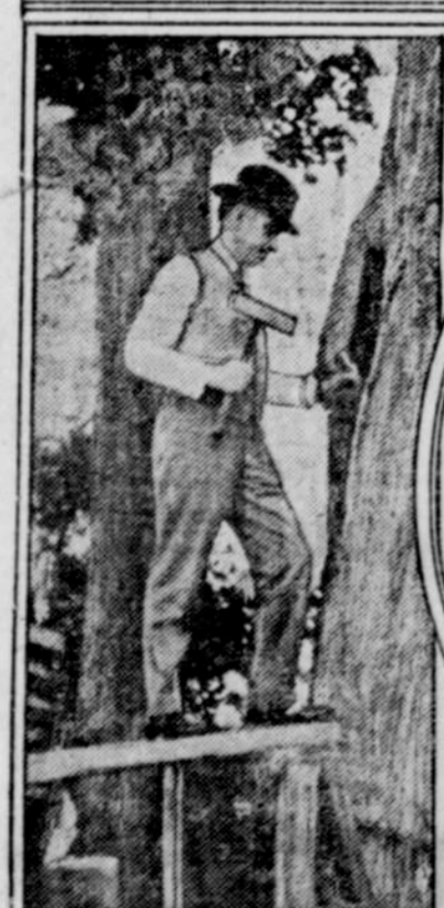
DESERVING A FAVORITE OLD TREE AT PLYMOUTH

Perennially, aspirants to public office, mindful of the farmer vote, become converts to the cause of agriculture and the farmer and demand justice for the tillers of the soil.