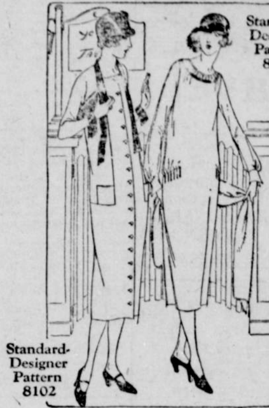
Standard-Designer Pattern 8102

You can make them even if you have never made a dress before!