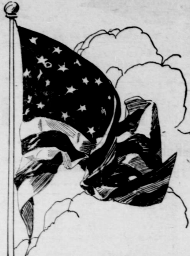
This Saturday, June 14, is Flag Day

A power greater than any municipal water plants extinguished the threatening forest fires last week. A power greater than the "Weather Man", at Portland visited the Western part of the state a few minutes after the populace read the prediction of "No Rain in Sight". An All-Wise Providence saved the day. The crops in western Oregon are looking fine. By due caution the fire danger has passed. It always rains on the just and unjust alike. To which we are duly thankful.