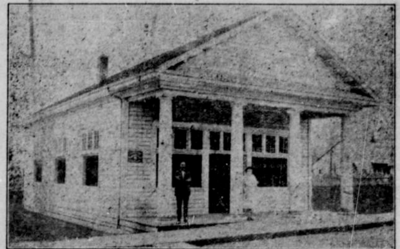
Bank of Vernonia.