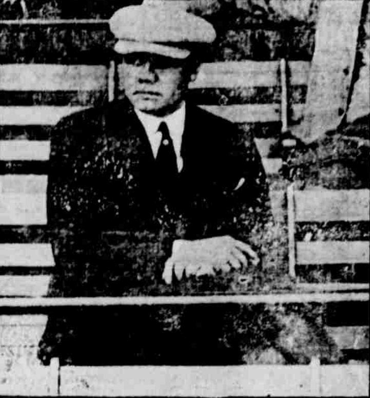
Babe Ruth, King of Swat, attends the Yankee ball games. But he sits in the grandstand. Hence the frown. Babe won't be in the New York lineup until after May 20. Judge Landis, baseball director, suspended him until that date because he barnstormed last year.