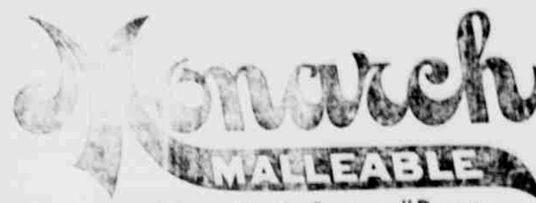
The "Stay Satisfactory" Range

We sell this famous range in several different styles. Far superior to many and better than most ranges. Get our prices before selecting your stove or be sorry ever after.