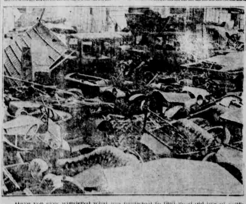
Have you ever wondered what has happened to that good old one of yours with which you parted when you got the shiny new one? The photograph shows a graveyard for old aristocratic Washington horseless carriages. Many of them have served faithfully in the best of fashions, yet now in their old age are left unprotected to the ravages of the elements.