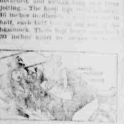
The baby is thoroughly comfortable in the hammock.

COMFORTABLE PLACE FOR CHILD IN AUTO But Little Material Needed for Making Hammock. Hammock Takes Up Room Usually Occupied by Third Person Riding in Rear Seat and is Easily Attached or Detached. His screen-door springs, a heavy loop, and a yard of heavy cotton twine, the materials necessary to make a baby's hammock, for the rear seat of a car, are the only things which give useful service and comfort. The hammock takes the place of the third person in the rear seat as shown. It can be quickly attached or detached, and is easily folded up when not in use. The loop for the seat belt is in the middle of the hammock. The hammock is 20 inches wide by 30 inches long.