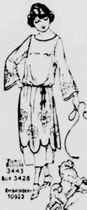
PATTERNS & DELTORS BUTTERICK DESIGNS

It brings a perfect mastery of the dressmaking art. Dress making consists of three things—cutting out—putting together—and fashioning. For years there has been the paper patterns, encouraging home dressmaking. Now for the first time, there has been created a complete system, so simple that the word system seems