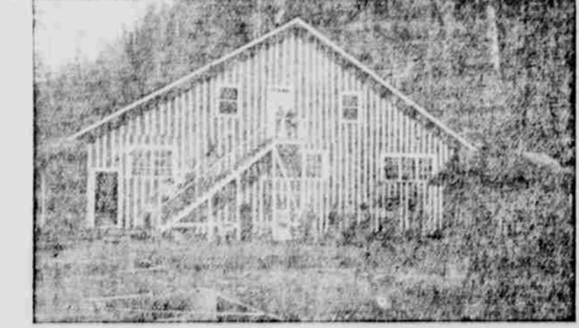
Gold Cross Hatchery on Frank River, which has Aero incubators to Hatch 8,000,000 Salmon in a Season.

A remarkable price reduction on positively 1915 Season Dress Shoes for Women. All sizes and widths included in the selection. Get a pair today. Your size may be gone tomorrow.