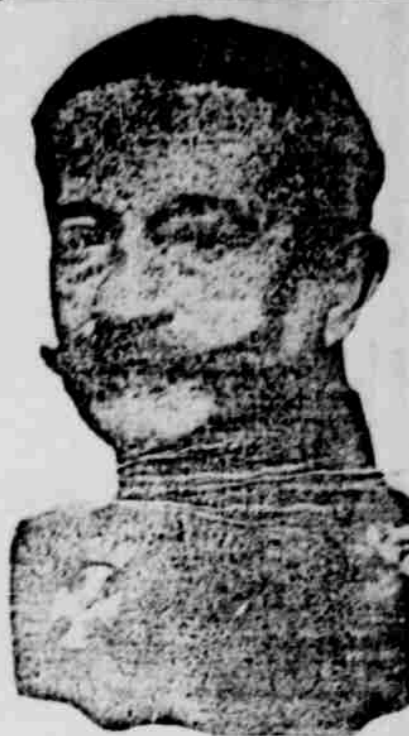
General Von Bissing, who was recently appointed governor of the Belgian territory controlled by Germany.