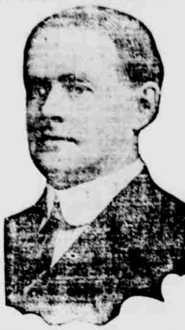
Charles N. Burke, South Dakota congressman, who defeated Senator Crawford for the republican primary nomination for United States senator.