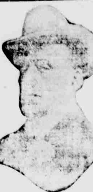
Sir Edward Carson, leader of the Unionists party in Ireland, opposed to Home Rule for Ireland.