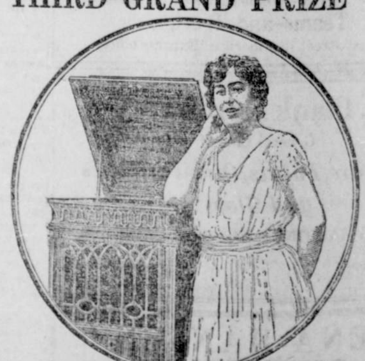
$150 NEW EDISON $150

This New Edison was purchased from Lamars Drug Store and is now on exhibition that you may see and play the late records on the New Edison the Headlight will give free.