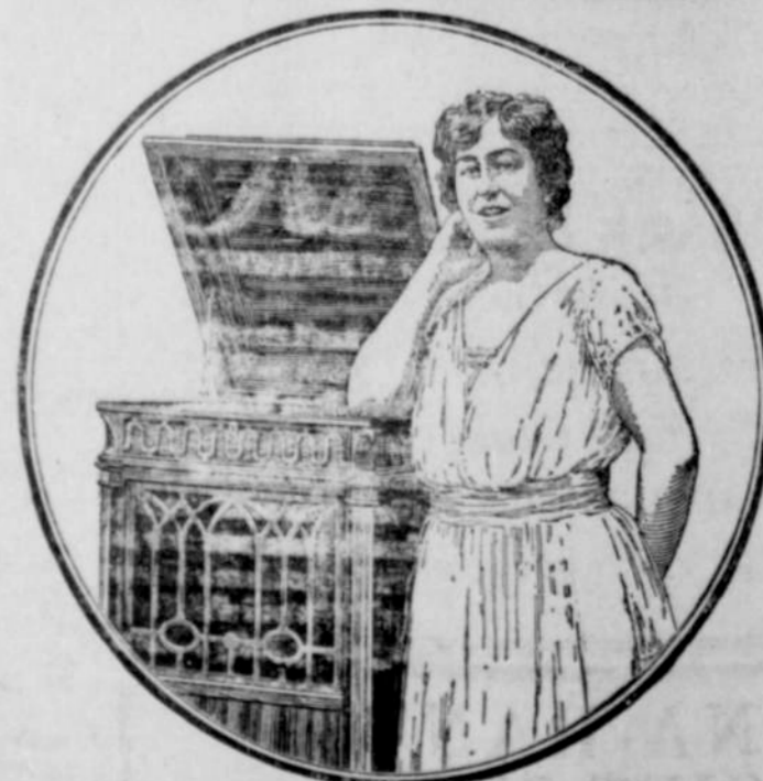
$150 NEW EDISON $150

This New Edison was purchased from Lamars Drug Store and is now on exhibition that you may see and play the late records on the New Edison the Headlight will give free.