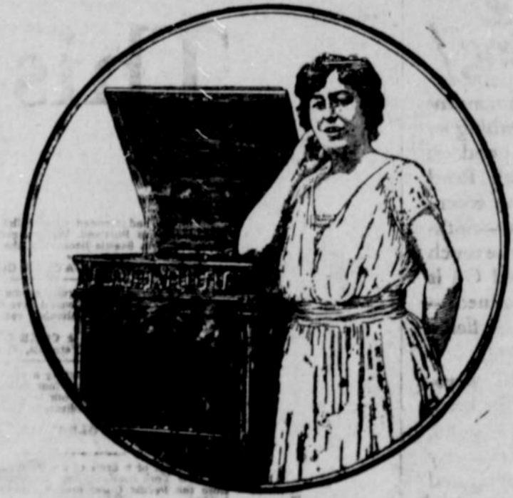
$150 NEW EDISON $150

This New Edison was purchased from Lamars Drug Store and is now on exhibition that you may see and play the late records on the New Edison the Headlight will give free.