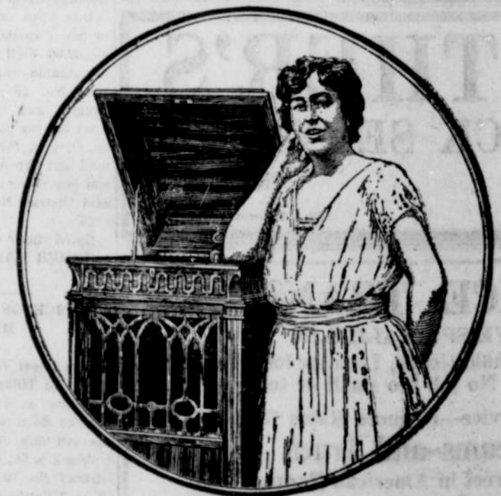
$150 NEW EDISON $150

This New Edison was purchased from Lamars Drug Store and is now on exhibition that you may see and play the late records on the New Edison the Headlight will give free.