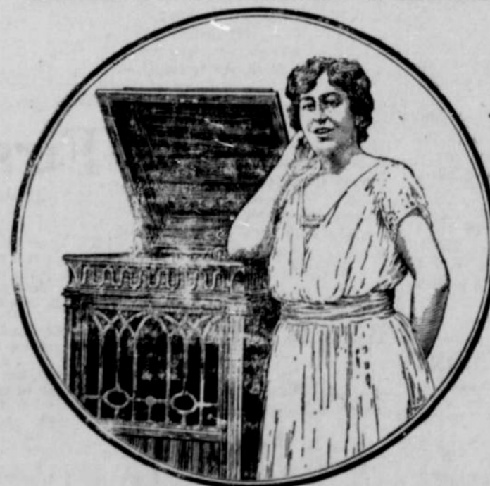
$150 NEW EDISON $150

This New Edison was purchased from Lamars Drug Store and is now on exhibition that you may see and play the late records on the New Edison the Headlight will give free.