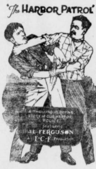
Part of this picture was filmed at Cape Mears, in Tillamook county.—Adv.