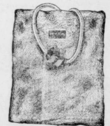
HEATING PAD Equipped with three heat control. Especially desirable for older people for quick relief from aches and pains. PRICE $10.00

Why Not Make This An ELECTRICAL CHRISTMAS Electrical Gifts Are a Constant Source of Pleasure and Satisfaction