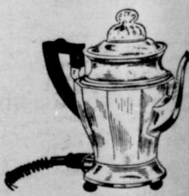
PERCOLATOR The Electric Percolator makes the best coffee. Does not absorb the bitter flavors that are in the coffee grounds. PRICE $6.00—$19.50