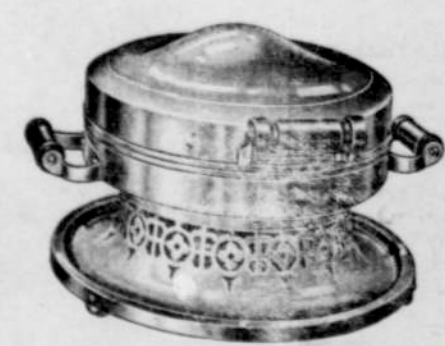
WAFFLE IRON Bakes a fine crisp waffle nicely browned on both sides. PRICE $15.00