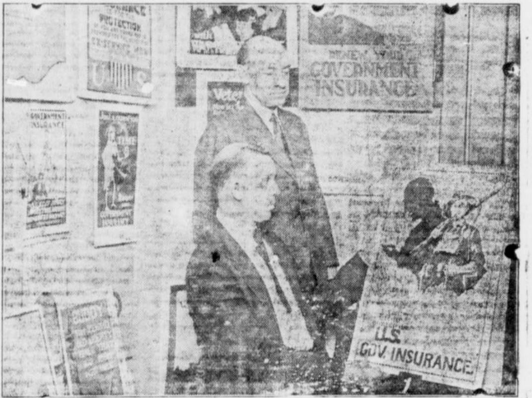
VET BUREAU CHIEF INSPECTS PRIZE VET POSTER "HEY BUDDIE"

This photo gives one an idea of the large number of people who did not attend.