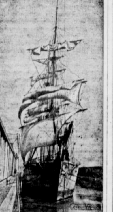
The big steel bark Eugenia Emilia is shown drying her sails at the New Bedford, Mass., state pier, under the first warm spring sun. A sight such as this is very rare.

The Emilia was engaged in the packet trade between Cape Verde islands and New Bedford, until seized by the government after her last voyage because of carrying contraband liquor and dope. She was sold at auction under a government libel seeking customs penalties. She is a craft of 80 tons and was a former German boat.