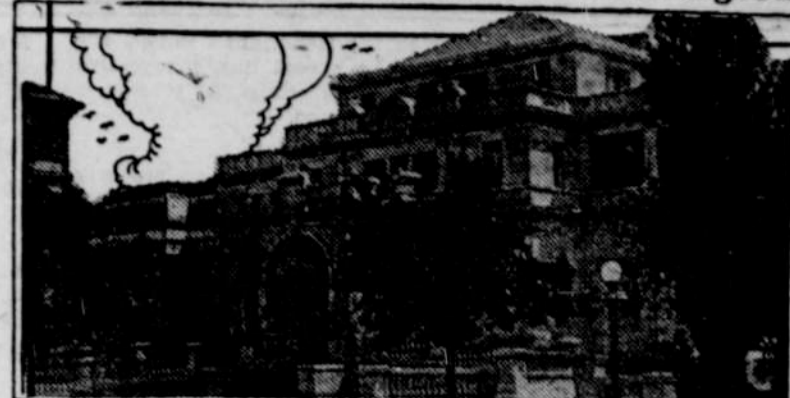
This structure is to be the official home of our vice-presidents, according to Washington reports. Vice-presidents have never been furnished with quarters. Mrs. Calvin Coolidge is said to have already inspected this home which is now nearing completion.

TELL your dealer you want to see a Fisk Tire beside any other he offers you. He has it in stock or can get it. See for yourself what the Fisk Tire has to offer in extra size and strength, how its resiliency compares when you flex the tire under your hand, how the depth of the non-skid tread looks beside other treads. This is the way to buy tires!