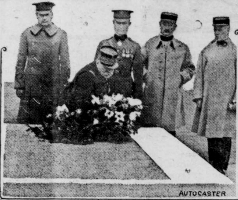
Marshall Joffre, hero of the Marne, made a special visit to Washington to place a wreath on the grave of America's Unknown Soldier, in the Arlington Cemetery, in behalf of France. The Marshall has just finished an extended tour of Asia and America.