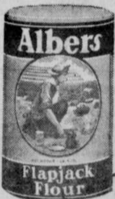
Carefully sealed cylindrical carton insures absolute sanitation.