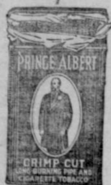
Prince Albert is sold in tippy red bags, tidy red tins, handsome pound and half pound tins, humidors and in the pound crystal glass humidors with a sponge moistener top.