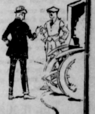
"The different tire views that come out in a chance talk."