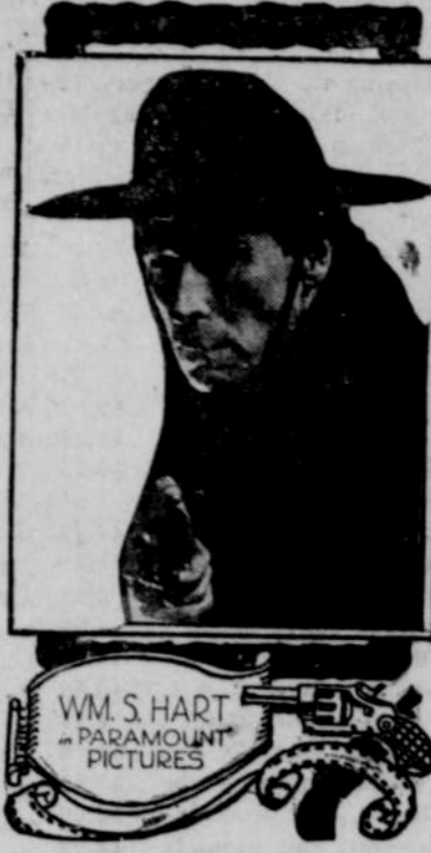
WM. S. HART A PARAMOUNT PICTURE