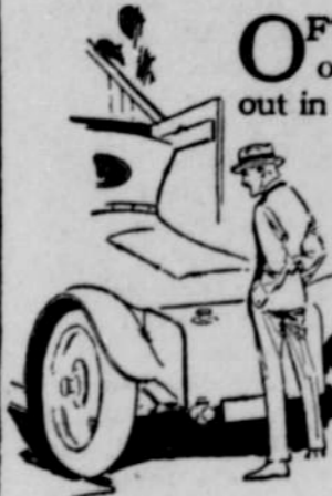
"Any U. S. Tire is a universal full-money's worth."

Any United States Tire is a universal full money's worth—backed up with a leadership policy of equal quality, buying convenience and price for everybody.