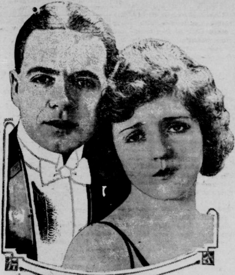
DOUGLAS McLEAN and DORIS MAY in the THOMAS H INCE production 'LET'S BE FASHIONABLE' A PARAMOUNT ARTCRAFT PICTURE