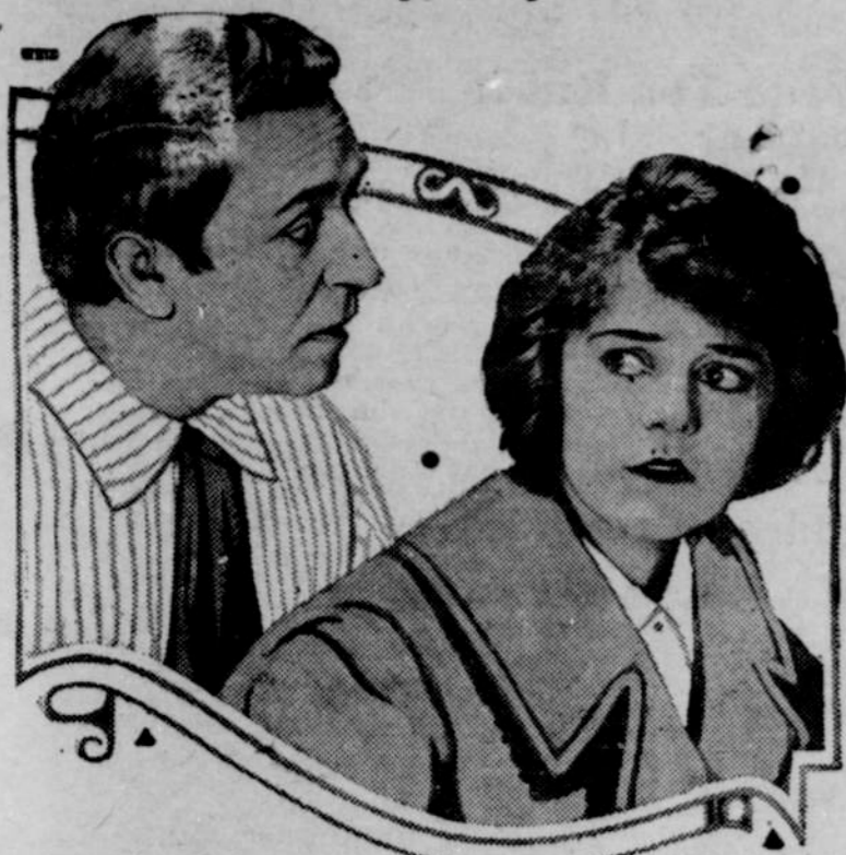
NOAH BEERY and MABEL JULLIENNE SCOTT in a scene from GEORGE H. MELFORD'S production "THE SEA WOLF" A PARAMOUNT AIRCRAFT PICTURE