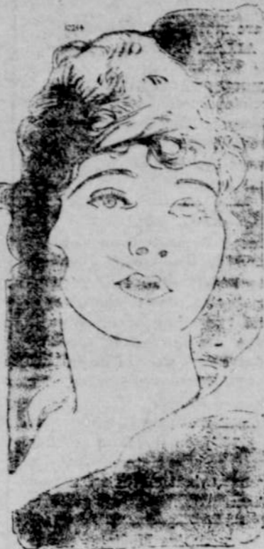
ANNA Q. NILSSON in "THE FIGHTING CHANCE" A PARAMOUNT AIRCRAFT PICTURE

Taken from the book by Robert W. Chambers